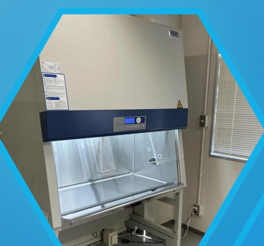
Biological Safety Cabinet

With the support of our local partner, Haier Biomedical's blood refrigerators and ultra-low temperature freezers have been put into use smoothly, playing an important role in laboratory, blood, medicine and other related scenarios successfully.