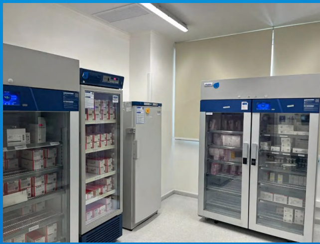
Hospital Biprovincial Quillota Petorca, Santiago

Hospital Biprovincial Quillota Petorca is a new hospital with 200 beds in Santiago. To meet the pharmaceutical supply requirements of different patients, it intends to expand the scale of its pharmacy and upgrade the pharmacy storage product available for patients, striving to provide a secure and stable storage environment for pharmaceuticals.