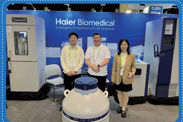
The Haier Biomedical Team at the AACR Exhibition

During the four-days exhibition, Haier Biomedical attracted many global buyers to consult, showing a strong interest in the products and solutions and given high evaluation and recognition, reached new deals to procure products directly during the event.