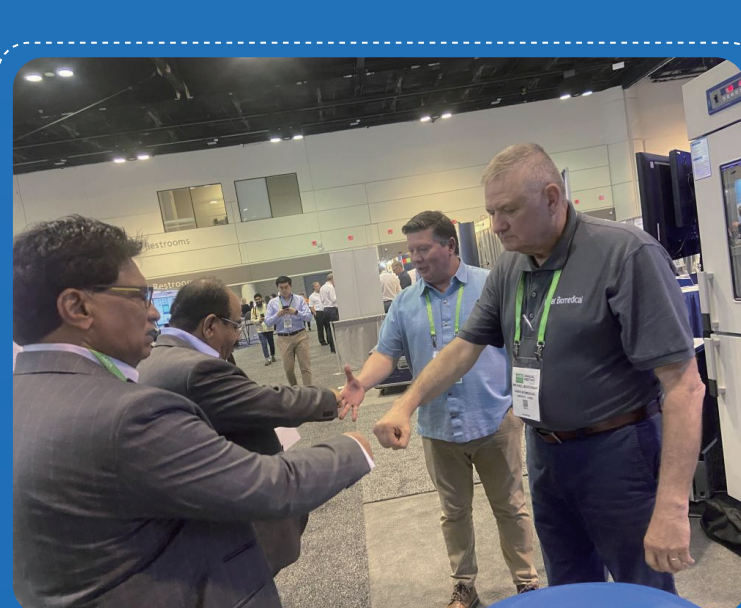
Haier Biomedical Products Have Been Highly Recognized by Local Customers