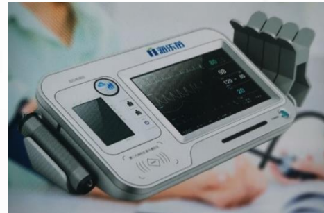
Follow-up Health Examination System