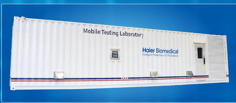
Mobile Testing Laboratory